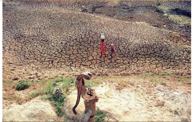
The impacts of climate change include severe droughts which lead to water scarcity (Dhaka River System)