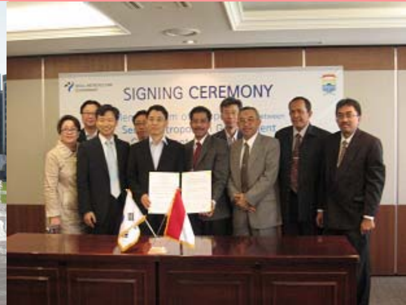
Signing Ceremony between Seoul and Palembang

Mumbai n Palembang are planning for Bus Rapid Transit (BRT) and improve its transport system