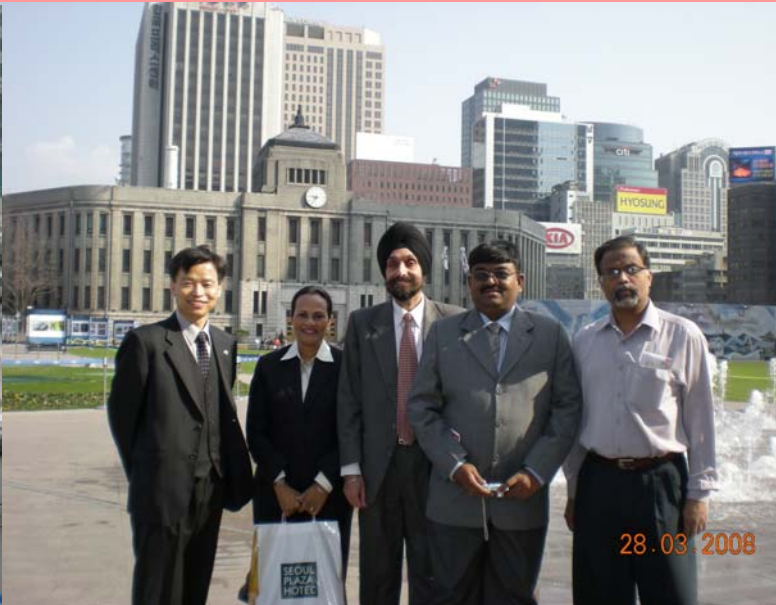
Representatives from Mumbai visiting the City Hall Square