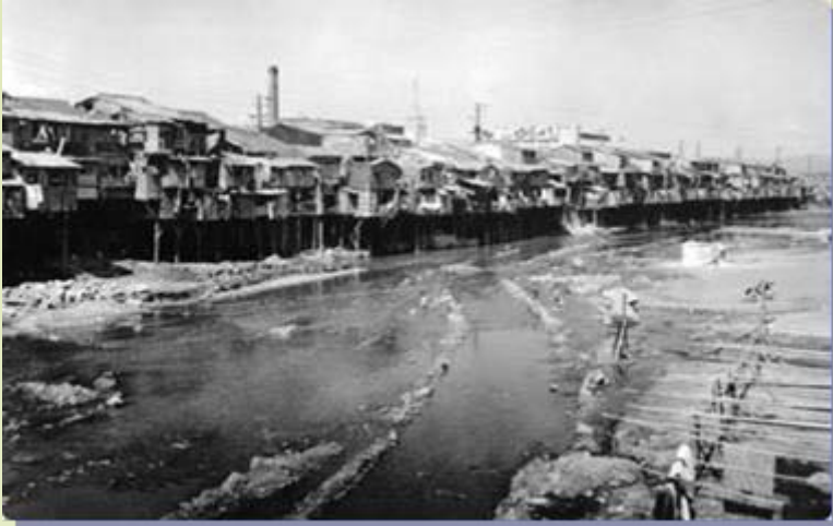
Shantytown before restoration: before the 1960s