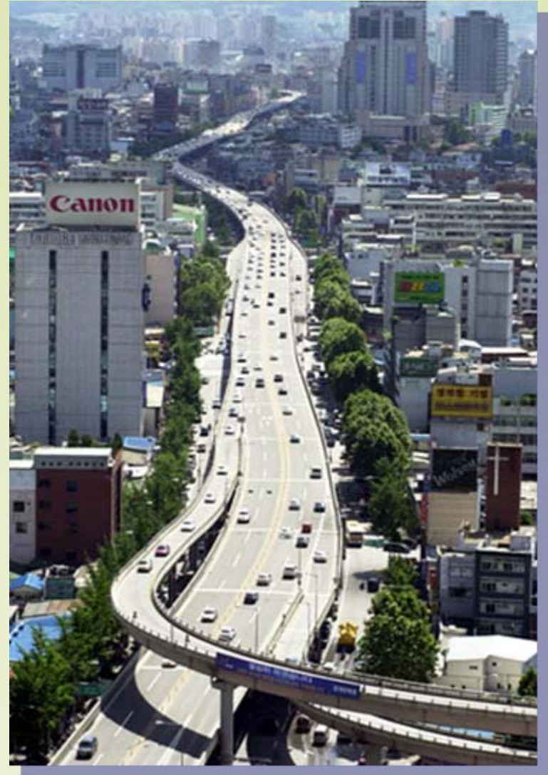
Construction of elevated highway: 1967~1971