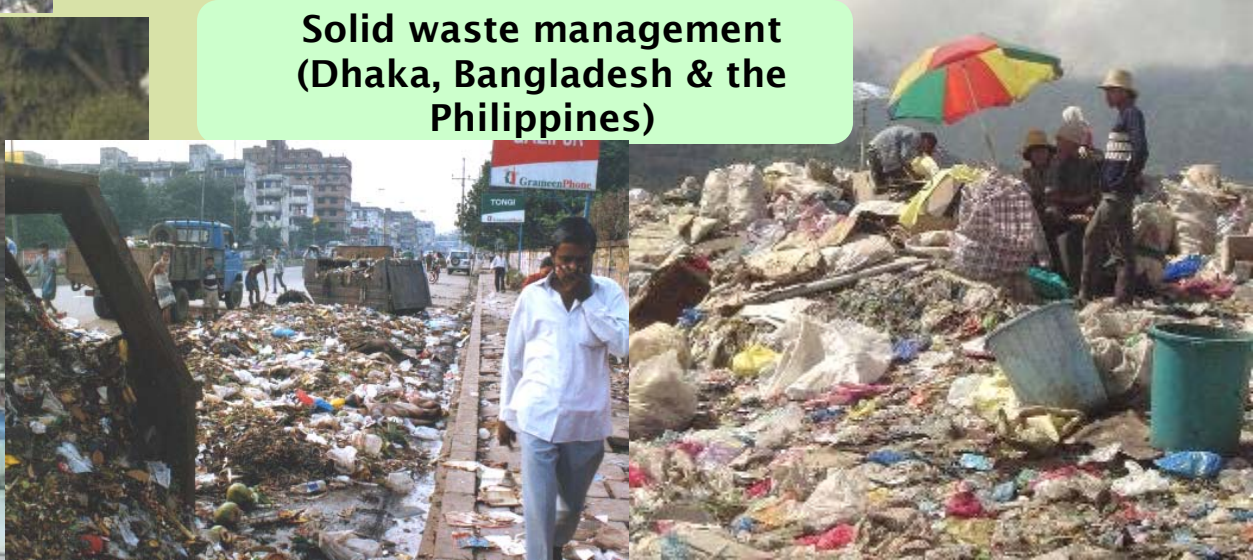
Solid waste management (Dhaka, Bangladesh & the Philippines)