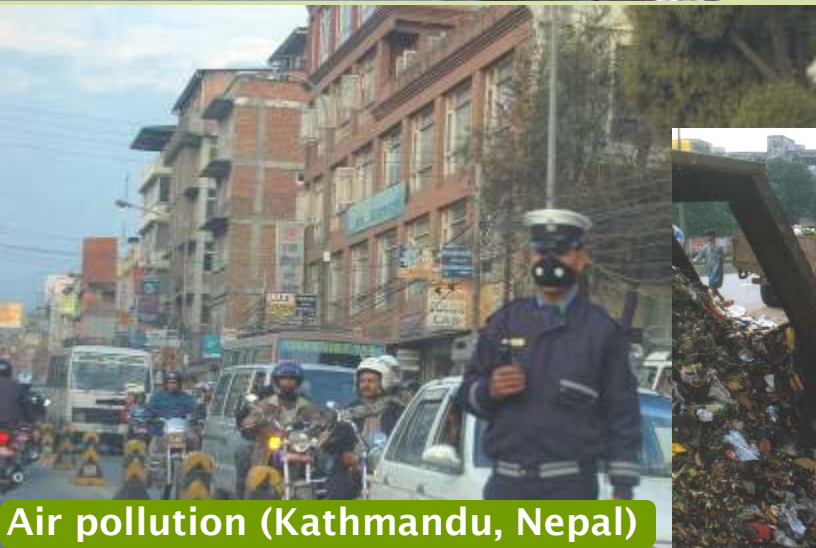
Air pollution (Kathmandu, Nepal)