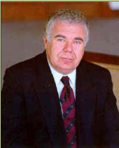
Jaime Lerner, Curitiba