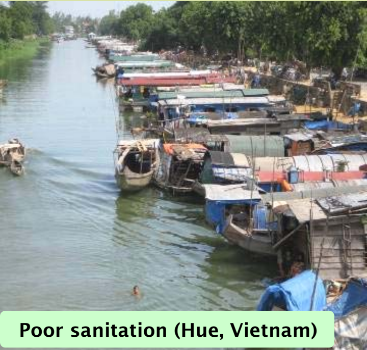
Poor sanitation (Hue, Vietnam)