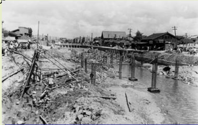
Construction to cover Cheonggyecheon: 1958~1977