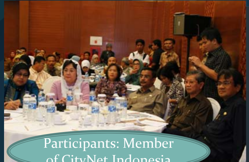
Participants: Member of CityNet Indonesia

Output: Indicators (physical and non physical) in MDGs point of view to develop gender friendly-city