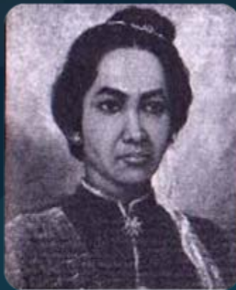
Cut Nyak Dhien