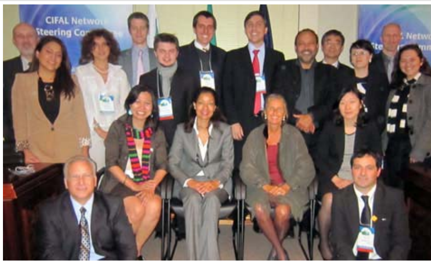
Participants at the 2011 UNITAR CIFAL Steering Committee hosted by CIFAL Curitiba; (bottom right) a visit to IPPUC (Institute of Research and Urban Planning of Curitiba) - planning agency at a renovated factory site - the agency ensures participatory and integrated planning of the city; (below) Bus Rapid Transit - Curitiba's attraction to the world.