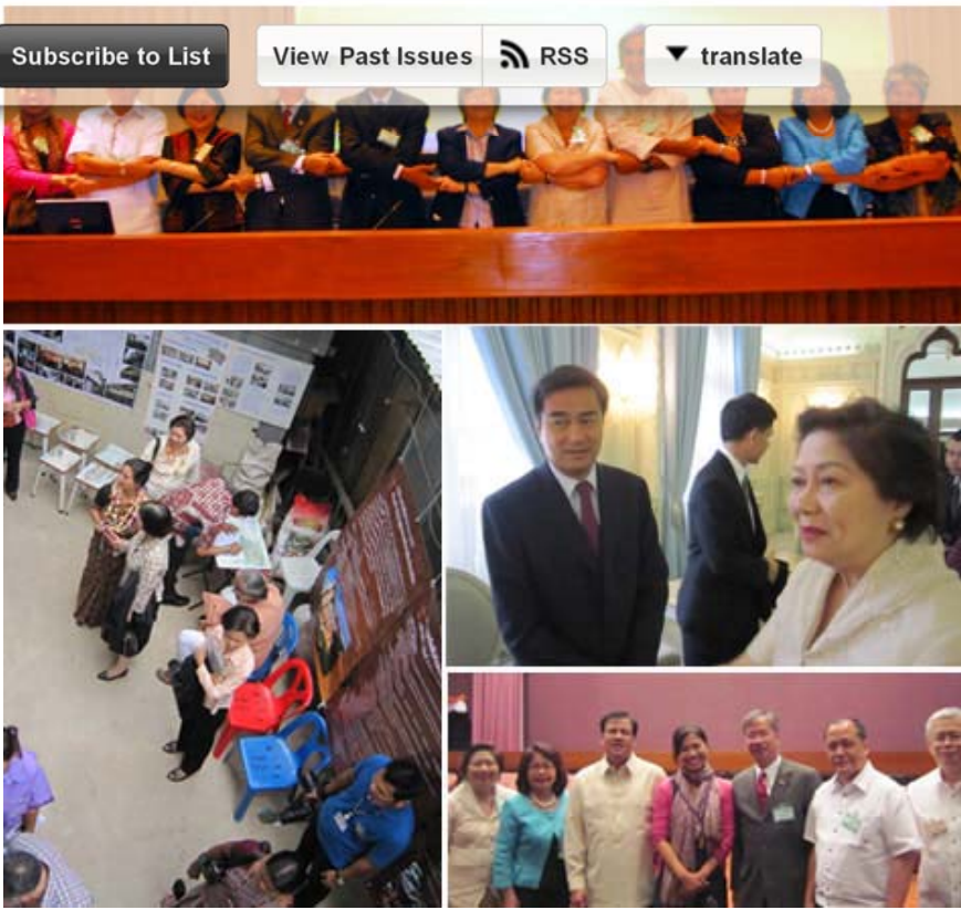
(top) signing ceremony between ACHR and CITYNET witnessed by members and the urban poor, (right) dialogue with and visit to the Prime Minister of Thailand, H.E. Abhisit Vejjajiva, (left) Study Visit at the Ban Mankong's upgrading programme (bottom right) members with former Mayor of Naga, Mr. Jesse Robredo, now Secretary of the Department of the Interior and Local Government of the Philippines; (below) signing ceremony between CDIA and CITYNET at the Pre-Executive Committee Session.

Forming and strengthening partnerships as well as the building of awareness were central to the fruitful outcomes of CITYNET's participation at the 5 th Asia-Pacific Urban Forum (APUF) organised by UNESCAP in Bangkok on 20-25 June 2011. "Cities of Opportunity: Partnerships for an Inclusive and Sustainable Future" was the focus of this key event where CITYNET members and partners took the opportunity to network, share and most importantly develop practical solutions. CITYNET brought more than 60 participants to APUF which UNESCAP coordinates every four years (the 4 th APUF was organised in conjunction with the 2005 CITYNET Congress in Hanoi).