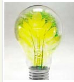
Save Energy Challenge - Summer 2011