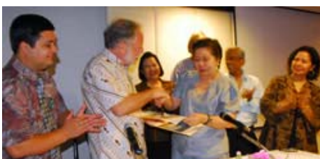
CITYNET is pleased to announce the signing of Memorandum of Agreements with CDIA on capacity building and also with ACHR on a community-housing and livelihood improvement programme. The signing of the Bangkok Declaration for