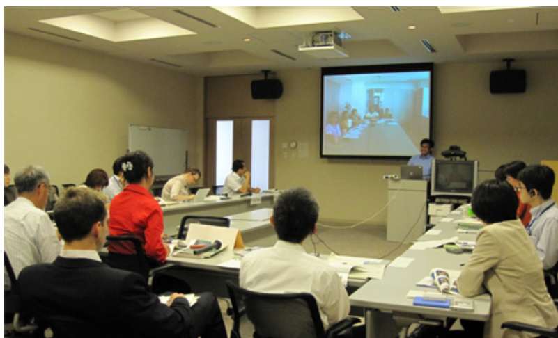
POST-AWAREE participants in JICA offices in Yokohama, Japan

Representatives from the cities of Colombo, Da Nang, Dhaka, Makati and Yokohama came together again for the second POST-AWAREE Project TV Conference on June 25. Presentations on the progress and the challenges on environmental initiatives in each of the cities were made as part of an ongoing monitoring programme. Highlights, among others included: