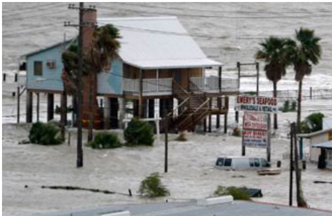
Flooding in coastal Bangladesh. Image Reuters. May be subject to copyright.

On May 26th Cyclone Aila devastated areas in the Bay of Bengal affecting areas in Eastern India and Bangladesh including CITYNET member Khulna City in Bangladesh. The torrential rains and strong winds caused hundreds of deaths and left many thousands more homeless without or with little access to basic necessities such as clean drinking water.