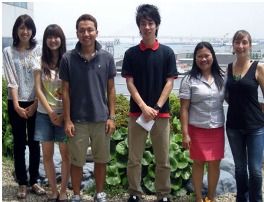
YouthNet at the CITYNET Secretariat, Yokohama, Japan

As a kick-off activity, the core team of the CITYNET YouthNet (as an initial name) from Japan shall visit Makati City, Philippines on August 6 - 12, 2009 to familiarise themselves with the different activities and programmes for youth living in a developing country. CITYNET YouthNet is a group of university students who would like to share their time and dedication to help their fellow youth, especially the less privileged through the conduct of various programmes parallel to the vision and objectives of CITYNET. During their study visit, the students will have the opportunity to observe the different programmes and projects initiated by Makati for the youth through discussions with the city officials in-charge and a field visit to the Youth Centre, schools, and communities. They will also have the chance to mingle with students' groups from several universities who do community outreach programmes for possible partnership.