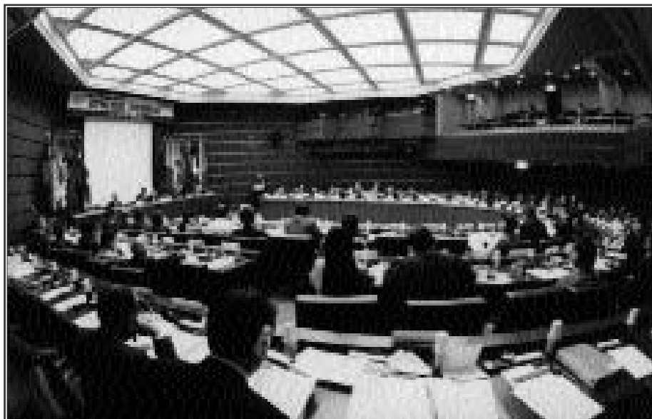
The General Council made decisions on policy and elected officers to 2001 See article left.

123 participants from 20 countries, representing 36 member cities and 24 other organisations, 18 different events, an estimated 30,000 public visitors, an outstanding range of speakers and panelists, and concrete recommendations for future directions - these were some of the achievements of last November's CityNet '97 Yokohama Congress. This issue of CityVoice gives a roundup of what happened.